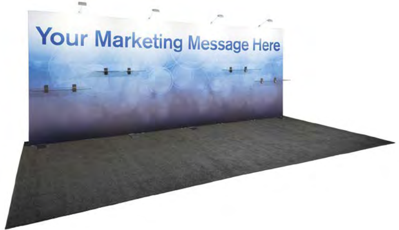
10' x 20' ft. unit unité 10' x 20'