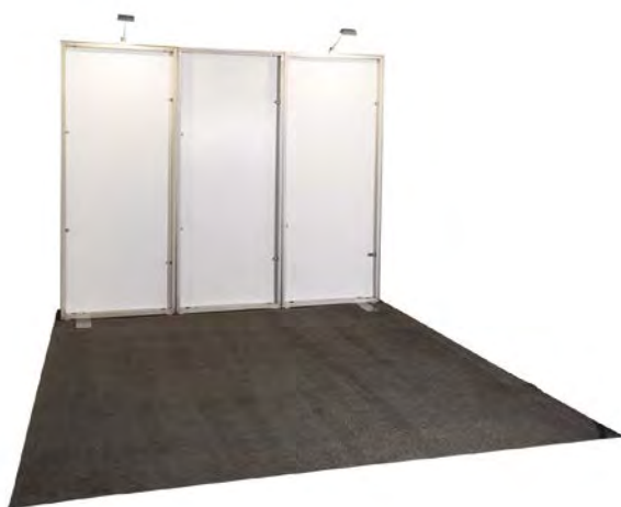
10' x 10' ft. frame cadre 10' x 10'

Cette option est disponible pour les clients qui ont précédemment loué un stand SmartFabric™ et réutilisent maintenant leurs graphiques. Les tissus d'autres sources ne seront pas installés sur ce cadre de location Freeman. Si vous avez besoin que Freeman crée un nouveau graphique, sélectionne la location de stand SmartFabric™. Aucun graphique en tissu ne sera fourni sans la location du cadre.