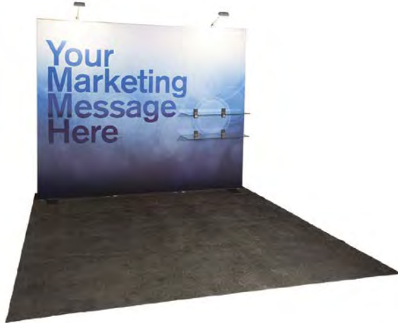
10' x 10' ft. unit unité 10' x 10'