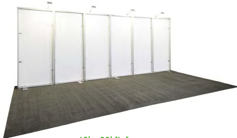
10' x 20' ft. frame cadre 10' x 20'