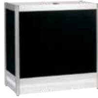
803 Counter Storage Unit 41" H x 41" W x 20" D