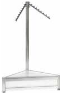
701 Bag Stand Holder